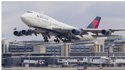
Home to Black Dog Energy Generation Plant, Blue Lake & Seneca Waste Water Treatments Plants and Flying Cloud & Minneapolis/St. Paul International Airports