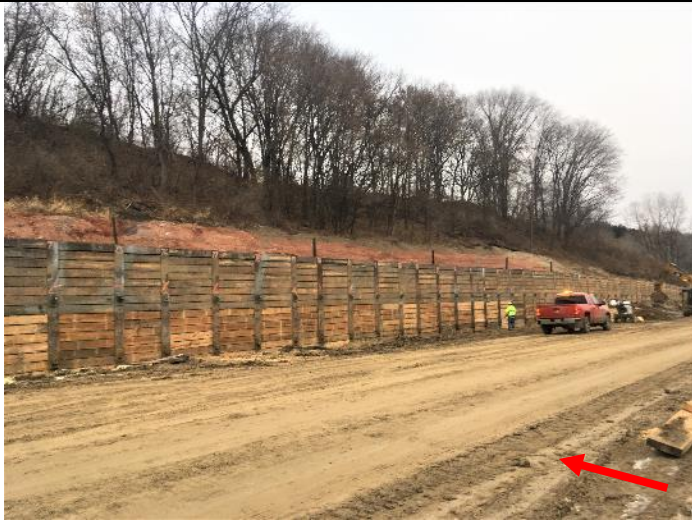
Photo No.: 14 Location: 44°48'55.95"N 93°31'29.65"W BMPs Present: None visible Description: Northern side of ROW conditions.