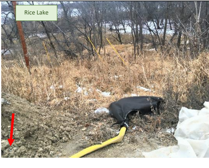
Photo No.: 15 Location: 44°48'56.32"N 93°31'27.26"W BMPs Present: Vegetative buffer; dewatering bag Description: Dewatering setup on the southern side of the ROW. At the time of the site visit, dewatering was not taking place.

Photo No.: 14 Location: 44°48'55.95"N 93°31'29.65"W BMPs Present: None visible Description: Northern side of ROW conditions.