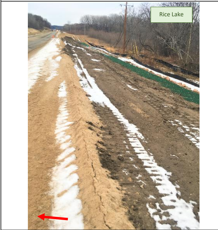
Photo No.: 1 Location: 44°48'49.30"N 93°31'57.53"W BMPs Present: Green geotextile blanket; two rows of silt fence Description: ROW conditions after significant snowmelt. This section of the project is stable with no evidence of new erosion.