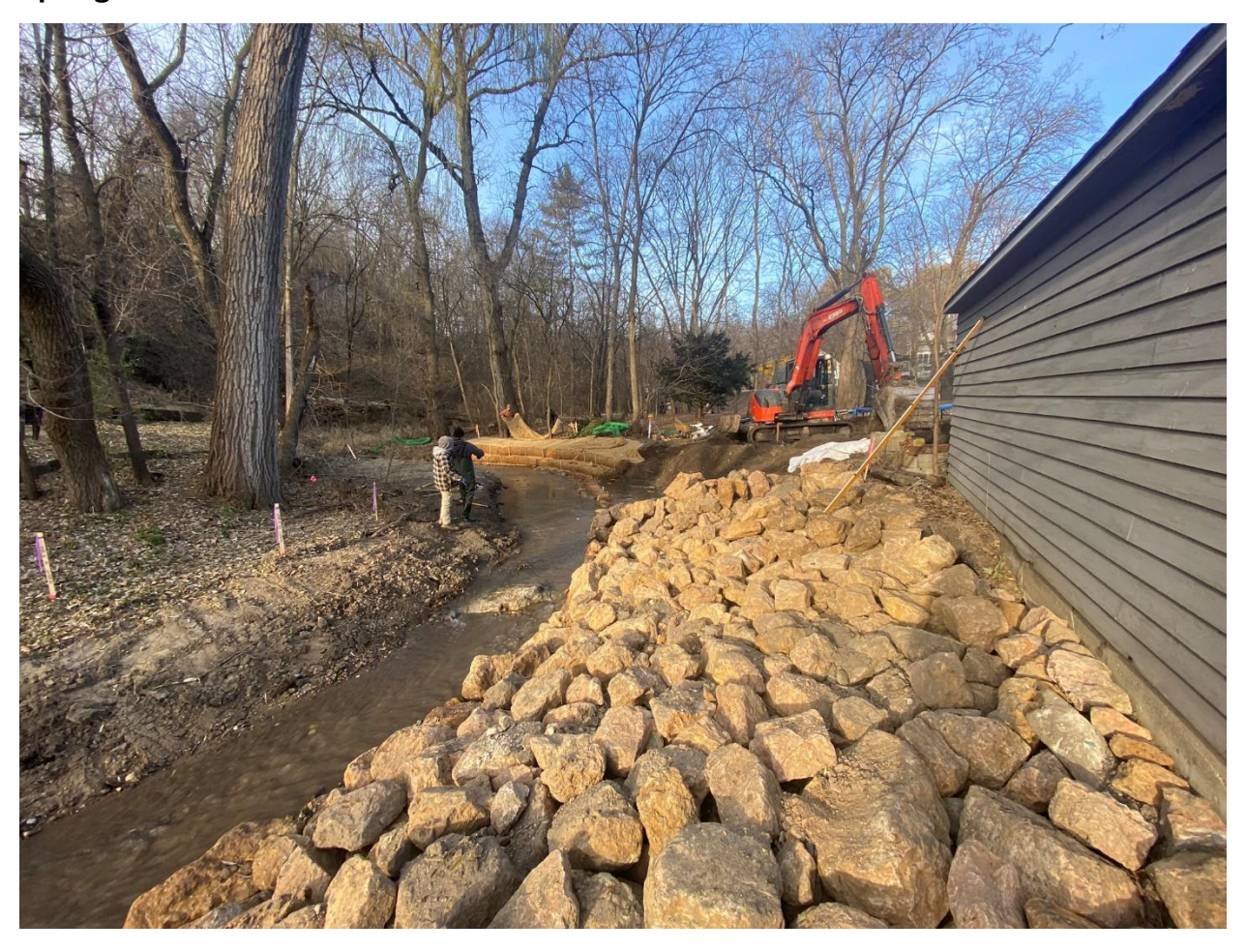
Image 7. Site 2 Riprap in the foreground and coir logs in the background