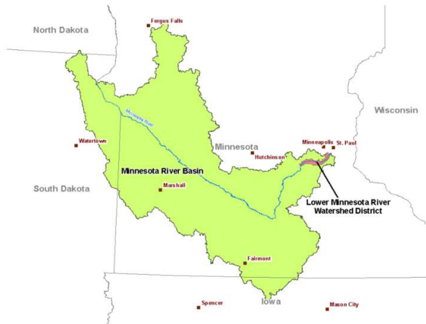
Figure 2-1: Minnesota River Basin Map