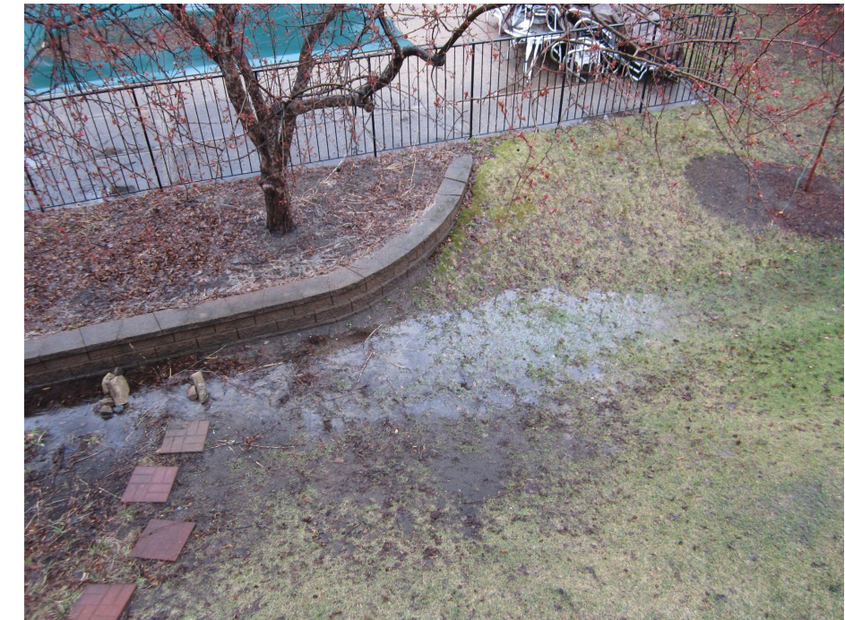
Water & mud