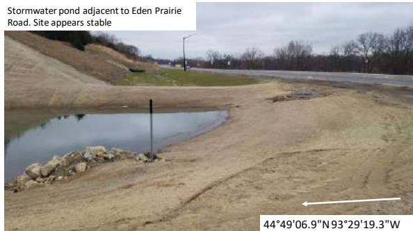
Stormwater pond adjacent to Eden Prairie Road. Site appears stable