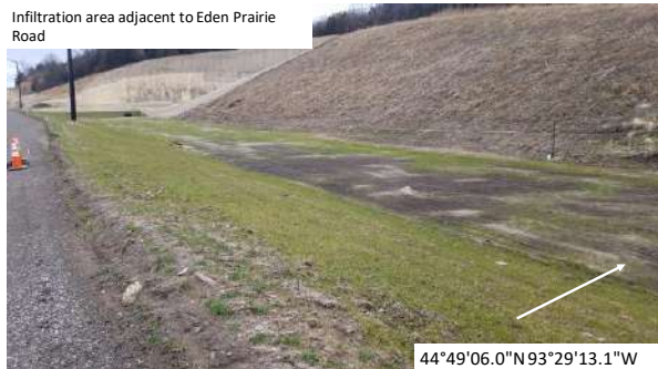
Infiltration area adjacent to Eden Prairie Road