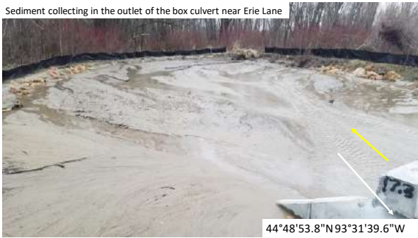
Sediment collecting in the outlet of the box culvert near Erie Lane