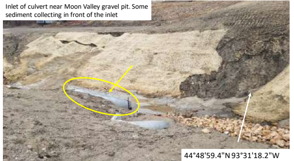
Inlet of culvert near Moon Valley gravel pit. Some sediment collecting in front of the inlet