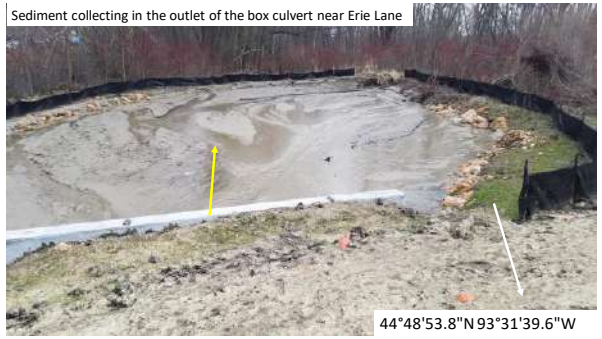
Sediment collecting in the outlet of the box culvert near Erie Lane