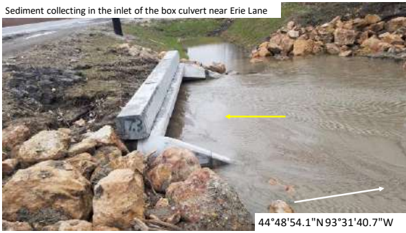
Sediment collecting in the inlet of the box culvert near Erie Lane