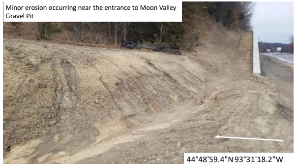
Minor erosion occurring near the entrance to Moon Valley Gravel Pit