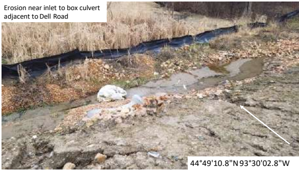
Erosion near inlet to box culvert adjacent to Dell Road