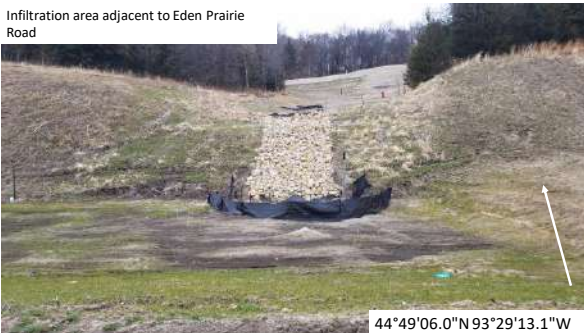
Infiltration area adjacent to Eden Prairie Road