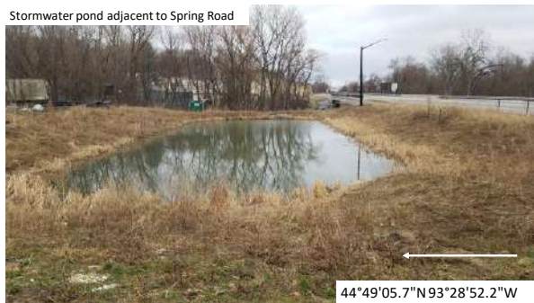
Stormwater pond adjacent to Spring Road