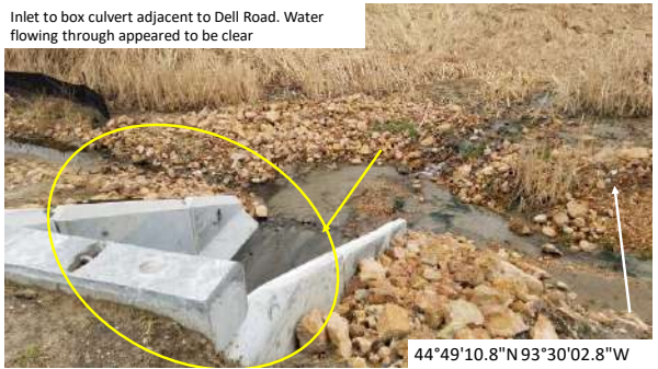
Inlet to box culvert adjacent to Dell Road. Water flowing through appeared to be clear