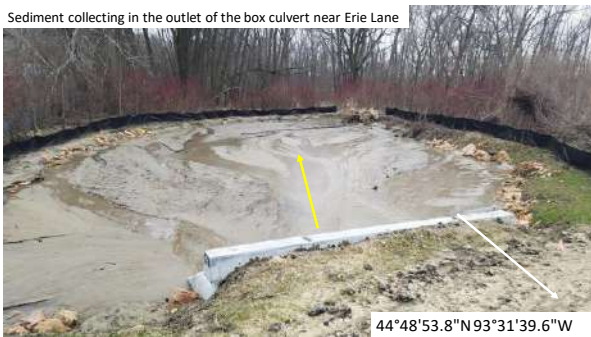
Sediment collecting in the outlet of the box culvert near Erie Lane