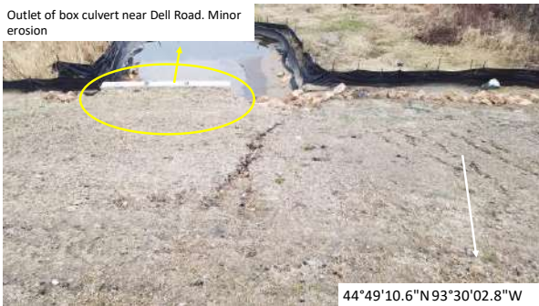
Outlet of box culvert near Dell Road. Minor erosion