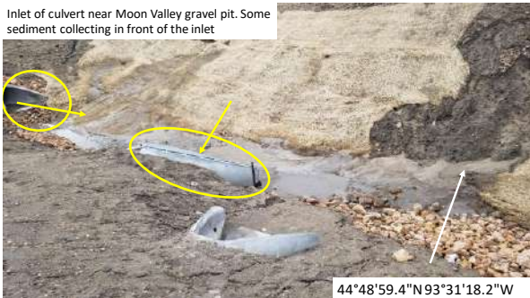
Inlet of culvert near Moon Valley gravel pit. Some sediment collecting in front of the inlet