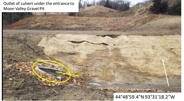
Outlet of culvert under the entrance to Moon Valley Gravel Pit