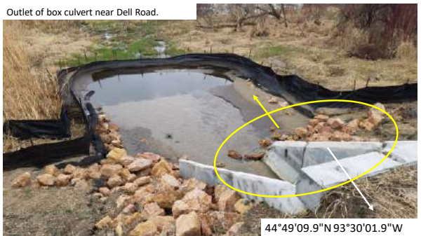
Outlet of box culvert near Dell Road.