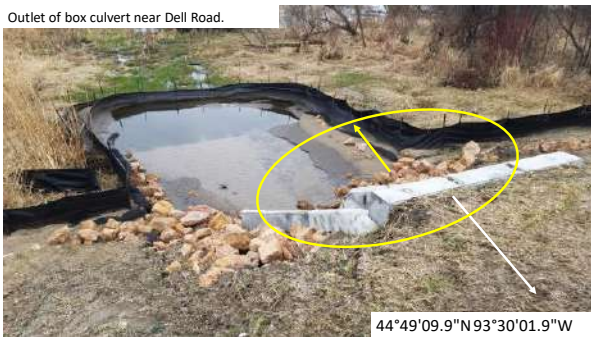
Outlet of box culvert near Dell Road.