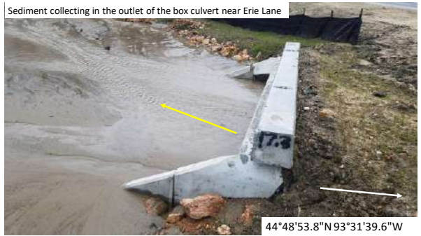
Sediment collecting in the outlet of the box culvert near Erie Lane