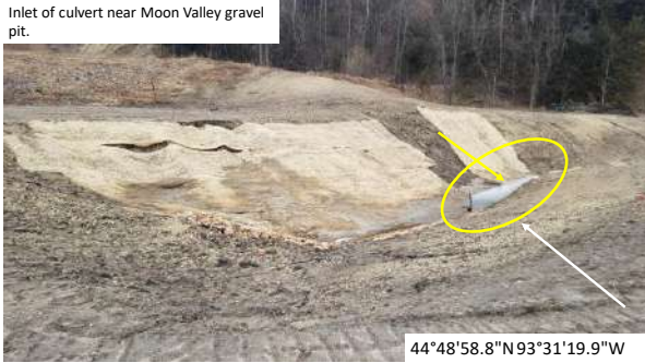
Inlet of culvert near Moon Valley gravel pit.