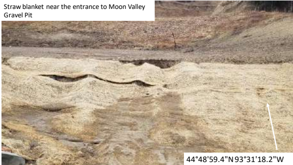
Straw blanket near the entrance to Moon Valley Gravel Pit